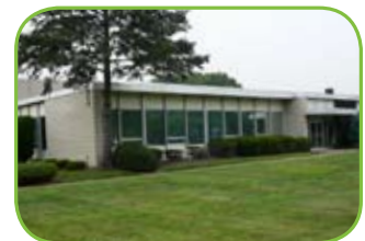
New York / New Jersey Metro

All our facilities are equipped with digital cameras, updated sprinklers, state-of-the art security and safety features.