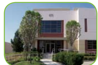
Los Angeles Metro